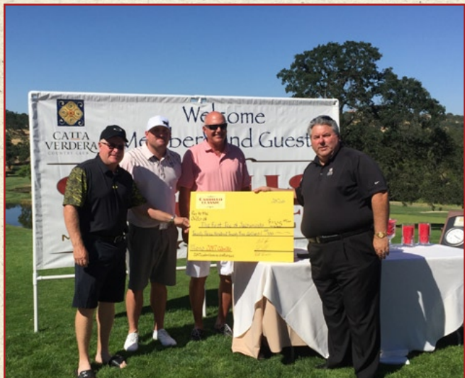
The First Tee Donation/Award