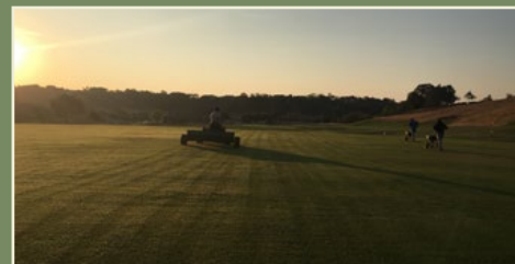
Overseeding Practice Tees

Your Turf Care department appreciates you all.